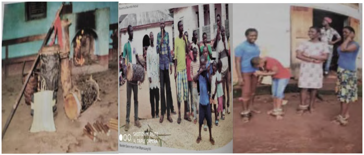
Source: His Royal Majesty Abumbi II Fon of Bafut, The Customs and Traditions of Bafut , Press Book, Press Print, Limbe, 2016.

Picture: Mandele Drums Prince on flutes and Princesses preparing to display