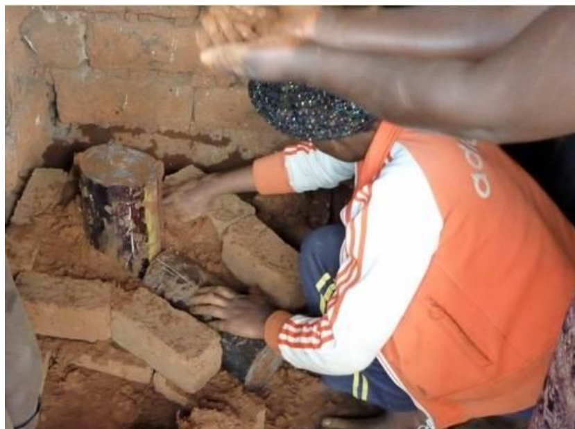
Figure 3. Initial stages-Building edges and combustion chambers