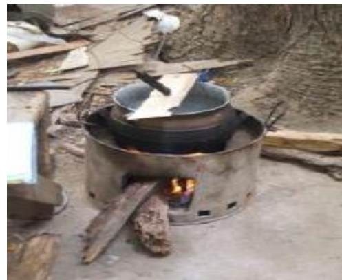
(b) Centrafricain improved stove