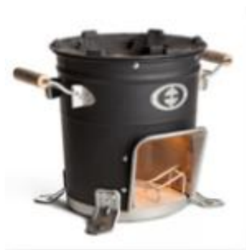
(d) M-5000 Wood Source (Envirofit, 2014)