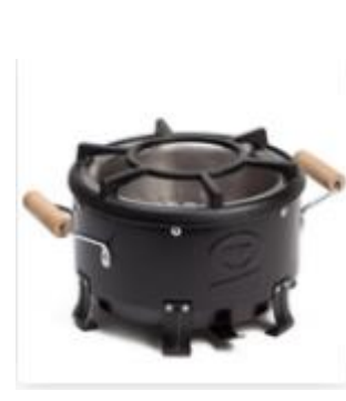
(e) CH-2200 Charcoal Source (Envirofit, 2014)