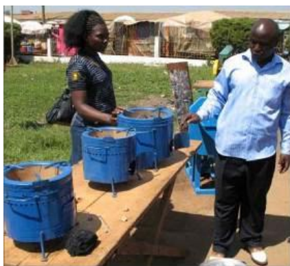
(c) Improved charcoal burners with ceramic linings Source (Nienhuys, 2010)