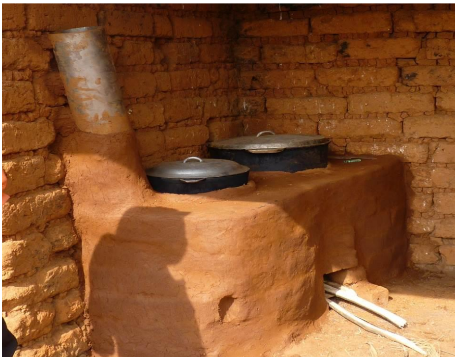
Figure 7. Complete stove ready for use